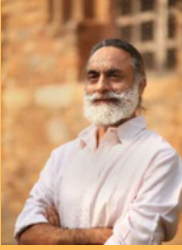
Navtej Singh Johar