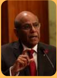
Amb. Shyam Saran